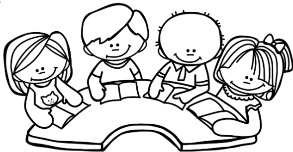
listened to a Bible story