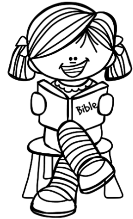
read the Bible