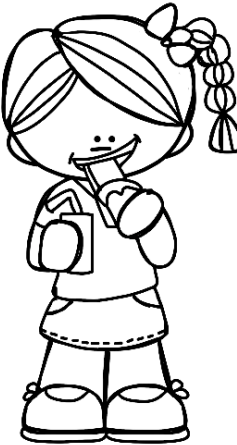
ate a snack